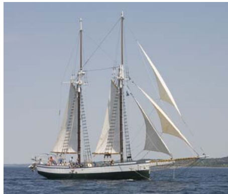
Madeline under full sail.