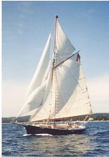
"Champion", the newest addition to the MHA fleet of historic vessels.