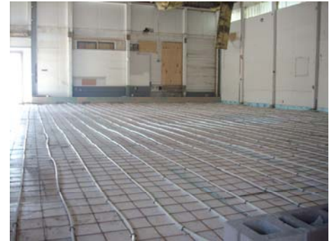
In-floor heat pipes are installed.

dates and times. Crew and guest spots are available on a first-come, first-serve basis. Please call the office to sign up.