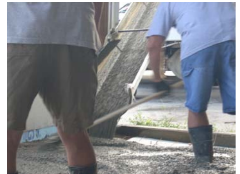
The concrete floor was poured in early August.

At last, the in-floor heat piping was laid down, and the concrete floor has now been poured. Firewall construction is next, followed by electrical and plumbing, and the Shop should be ready to go this fall. Stop by and have a look at the progress.