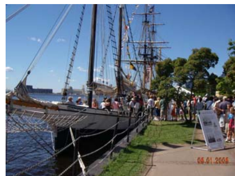
6-Visitors lined up to get aboard Madeline in Duluth, Minnesota.