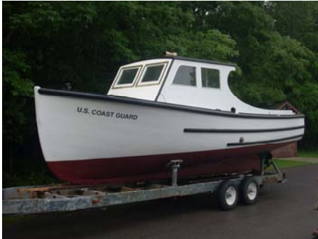
The Grand Traverse Lighthouse Museum's Lighthouse Tender- restored by MHA volunteers.

MHA's talented volunteers at the Peter J. Henry Boat shop have been busy on a number of projects this summer. Below are photos of the 1945 light house tender that was refurbished for the Grand Traverse Lighthouse Museum, which celebrated its 150 th birthday. Many thanks to the crew in the Shop for their fine work.