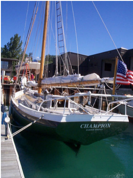
"Champion" at the dock.