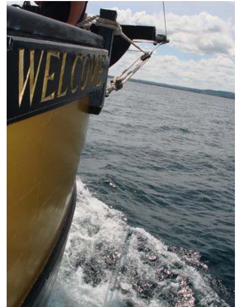
10-"Welcome" under power on West Bay, July 31st.

On July 31 st , WELCOME took a lap around the Bay under power. All hands are now at work on getting the rigging ready to set sails. Congratulations are due to the Welcome Committee and all the people that have worked so hard on her. Sailing dates on WELCOME will be announced in our September issue.