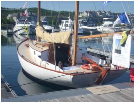
7-Our Herreshoff 28 "Arcturos" at the Bay Harbor Wooden Boat Festival.