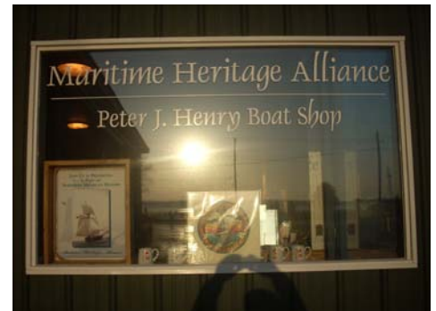
The Peter J. Henry Boat Shop, on M-22, Traverse City.