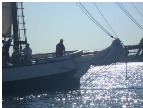
1-Madeline rolling into Harbor Springs in June, wedding party aboard.

(All meetings are held at the Heritage Center unless otherwise noted)