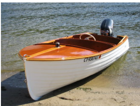
8-Our little 1954 Lyman 13 (next year, following restoration).