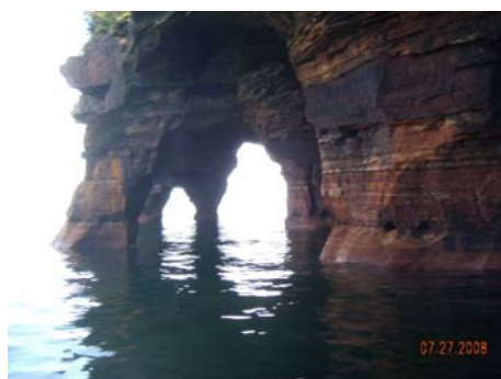
3-Cave formations in the Apostle Islands, Lake Superior.