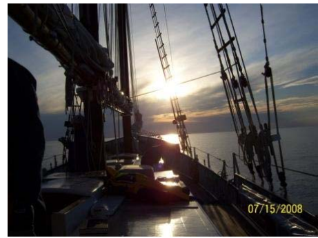
5-A perfect Lake Superior sunset.