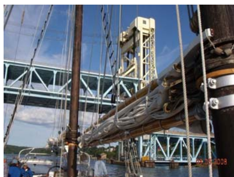
2-Through the Lift bridge in Duluth