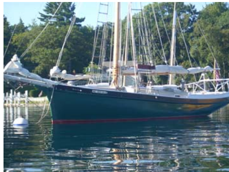
“Champion” on the hook.